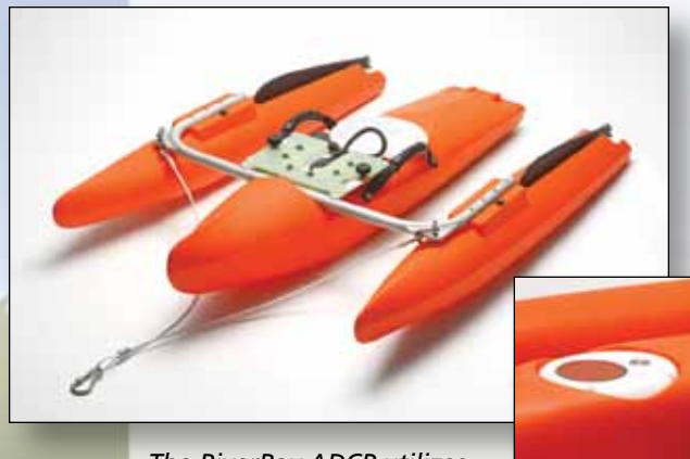
The RiverRay ADCP utilizes a flat-surface, phased array transducer.

From a shallow stream to a raging river, the revolutionary RiverRay delivers the simplicity and reliability your operations require, at a price that won't break your budget.